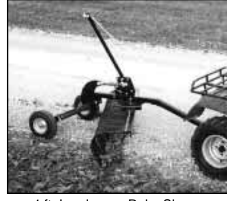
4 ft. Landscape Rake Shown